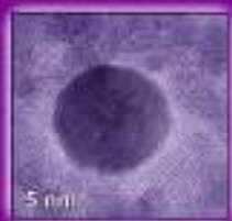
Electron Micrograph of Enercat™ Cerium Oxide Nanoparticle

A nano-particle formulation, Enercat™ is a fuel borne additive that catalyses combustion while simultaneously reducing harmful emissions. Enercat™ technology uses the oxygen storage capacity of cerium oxide to promote a more complete fuel burn which helps to reduce fuel consumption.